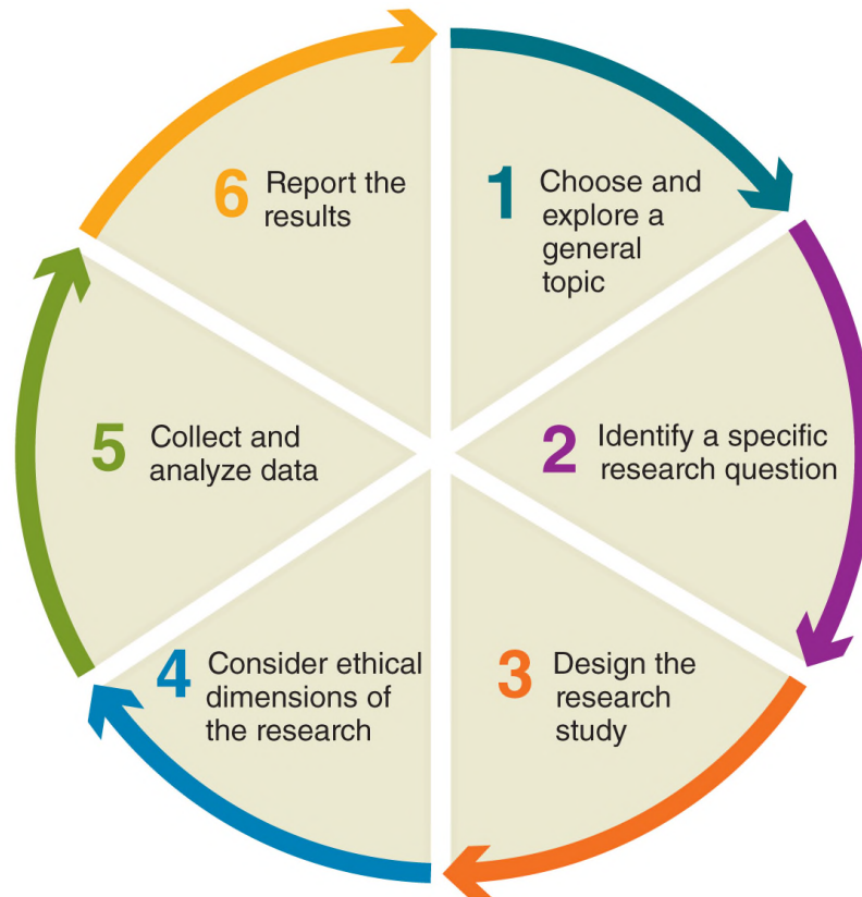
FIGURE 2.2 THE RESEARCH PROCESS

The research process can be thought of as a cycle because existing research is part of the scholarly literature that researchers consult when they develop and design a new study. When findings from a new study are published, they become part of the research literature that future scholars will review as they develop their own research projects.