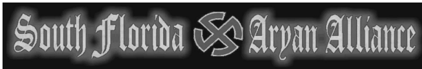
Figure 2.2 South Florida Aryan Alliance banner.