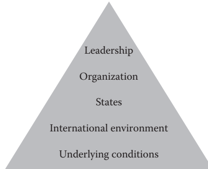
Figure 2.3 National strategy for combating terrorism structure.